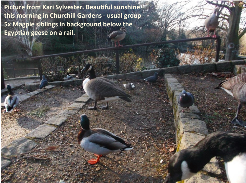
Beautiful sunshine this morning in Churchill Gardens - usual group - 5x Magpie siblings in background below the Egyptian geese on a rail.

already exist. This report is devastating to read, but it also tells us that realistic solutions already exist if we act now. We must urgently stop using fossil fuels and move to renewable energy. People here in the UK have been hit particularly hard by the gas price crisis because of our over-reliance on gas. We need a rapid move to cheap renewable energy to cut emissions, create green jobs and kick our expensive reliance on gas.