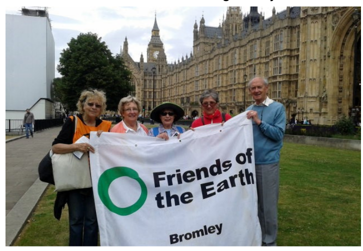
Bromley FoE Newsletter July 2015