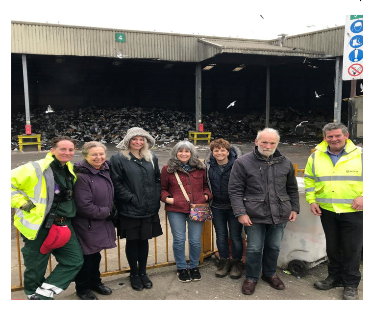
Bromley FoE Newsletter May 2018 - page 11