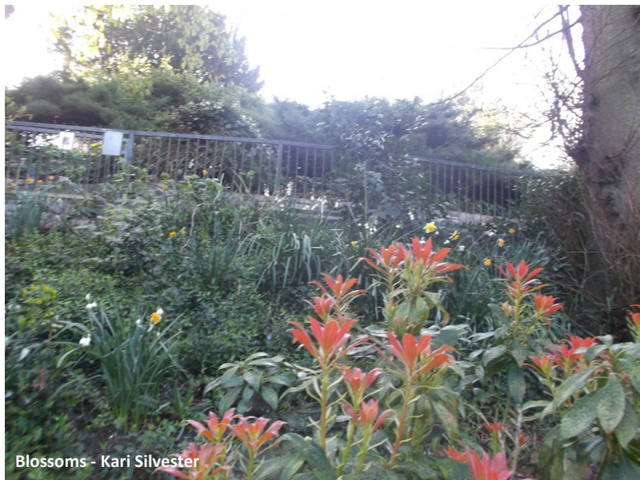
Blossoms - Kari Silvester

https://www.bromleyfriendsforum.org/uploads/1/0/7/2/10726735/toad_poster_2018c.pdf