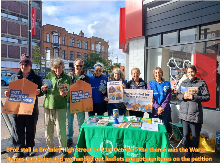
BfOE stall in Bromley High Street on 21st October. The theme was the Warm Homes Campaign and we handed out leaflets and got signatures on the petition

Assessment Update 2021). The average 2019 IMD score for Bromley is 14.2, with a lowest score of 5 in the Petts Wood and Knoll ward. The GLA's Bloomberg Associates 2021 Spatial Analysis of Climate Risk Across Greater London Flood Risk Map (p.20) identifies the River Cray Valley as the largest area in Bromley Borough at High Risk of flooding. The Environment Agency's long term Flood Risk Service Maps show the area around Hodsoll Court and adjoining Hodson Crescent as at the highest level of flooding risk. Bromley Council's reports usually contain a clause headed 'Impact on Vulnerable Adults and Children' which, so far, I have not once seen identify or examine the impacts of climate change on vulnerable communities. Indeed, in response to our Public Written